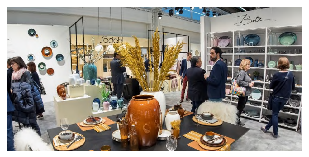
Trends and business at Ambiente 2020

Trends, new products and international business – these are traditionally at the focus of Ambiente in Frankfurt, which took place from 7 to 11 February 2020. The world's largest consumer goods trade fair had grown to 4,635 exhibitors¹ from 93 countries², covering 310,240 gross sqm³. Ambiente was the first leading trade fair to be affected by the impact of the coronavirus on travelling. Another clearly noticeable factor was Storm Ciara. Business in the halls, however, did not suffer as much as expected, and, in all, large numbers of orders were placed throughout the trends and new products platform. Nevertheless, exhibitors were disappointed with the strong sense of uncertainty among visitors and therefore the absence of quite a few retail channels. Yet those who did travel to Frankfurt benefited from an outstanding ordering environment.